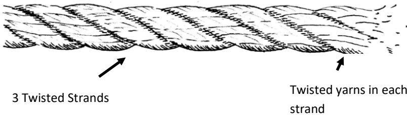
3 Strand Polypropylene